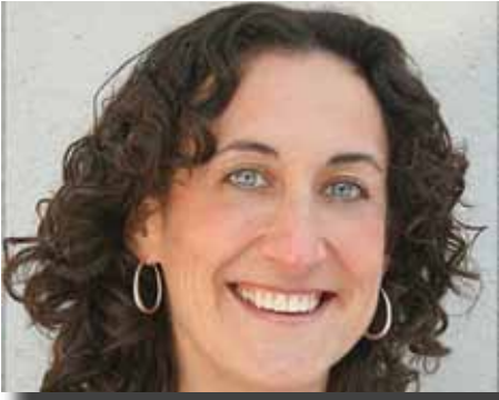
PA COMMONWEALTH COURT Kathryn Boockvar