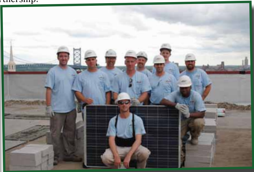
98 Electricians beginning the Solar Panel installation at the Bourse.

If you should divorce, it is imperative that you submit a copy of your divorce decree to the Financial Office as soon as the divorce is final. If your former spouse uses benefits past the date of your divorce, you will be responsible for reimbursing the fund for the entire cost of the benefits utilized!